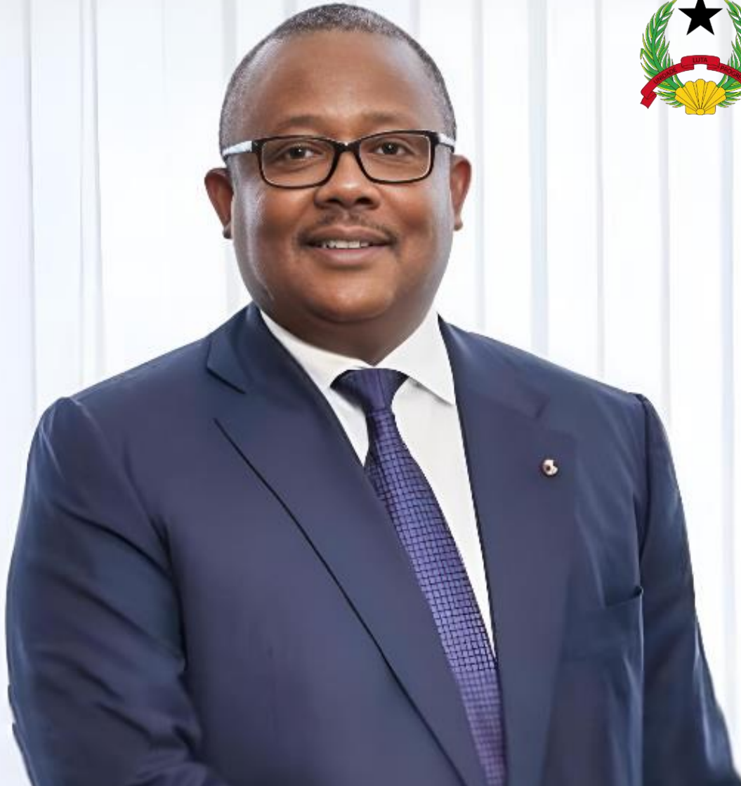
S.E. UMARO SISSOCO EMBALÓ, President of the Republic of Guinea Bissau

“The private sector plays an essential role in achieving the Sustainable Development Goals and Agenda 2063. To achieve these goals, it is crucial to mobilize the necessary financing to support private companies in their growth and contribution to the economy of Guinea Bissau”